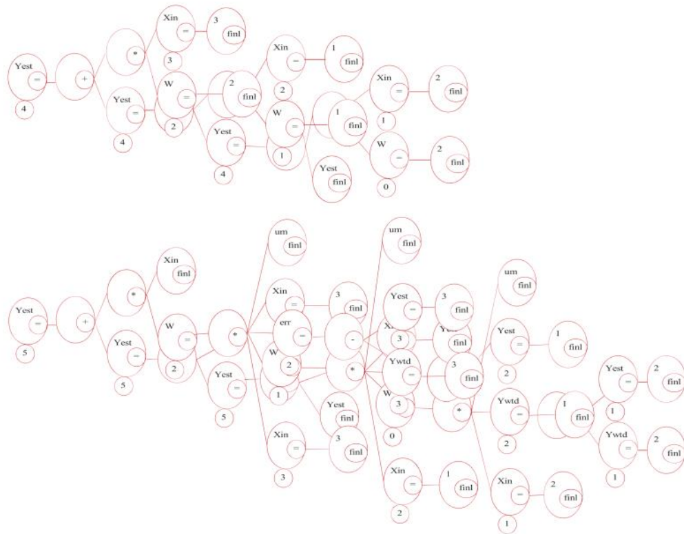
Figure 2. Partial Map generated by processing Algorithm 1 in the proposed compiler.

and Yestimated[5] and their DFGs in Figure 2. We can now globally assess the parallel potential of the target program. Accordingly to Amdhal’s law, the theoretical maximum achievable speedup S_{max} is limited by the inherent sequential fraction: “ f_s ” and given as: