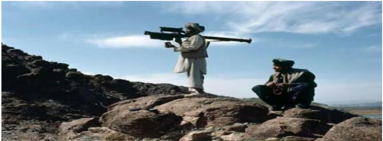
Fig. 7: An Afghan mujahideen aims a FIM-92 Stinger missile at passing Soviet aircraft, 1988.