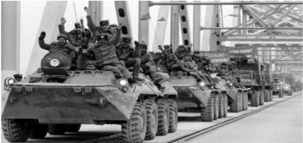
Fig. 8: Soviet troops leaving Afghanistan,1989.

The Soviet-appointed Afghan leader Najibullah instituted a broad reform of the state system and introduced a reconciliation and re-integration programme implementing the withdrawal. The Withdrawal was by rolling up Soviet garrisons from South to North on two axes to a defended lager area on the Soviet border. The Soviet main force crossed back into the USSR between February, 11– 14, 1989 ('Lessons from the Soviet withdrawal', n. d., p.2).