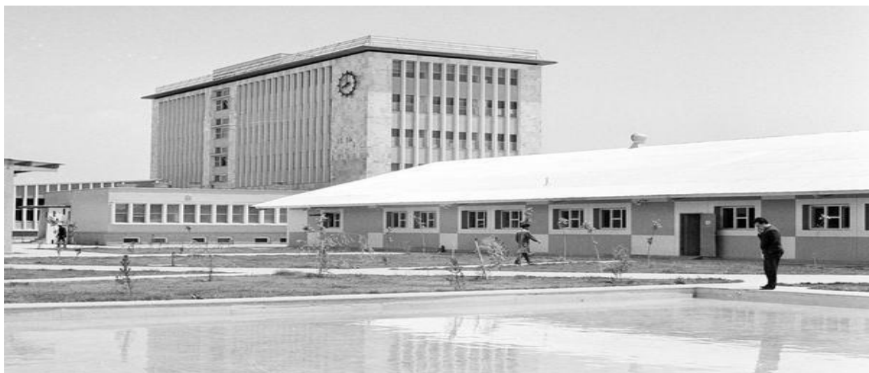
Fig. 1: Modern new Finance Ministry building in Kabul.

Advance was stopped in the 1970s, as a progression of ridiculous upsets, invasions, and civil wars began, turning around the greater part of the means towards modernization which took place in the 1960s (Taylor, 2013, para. 1).