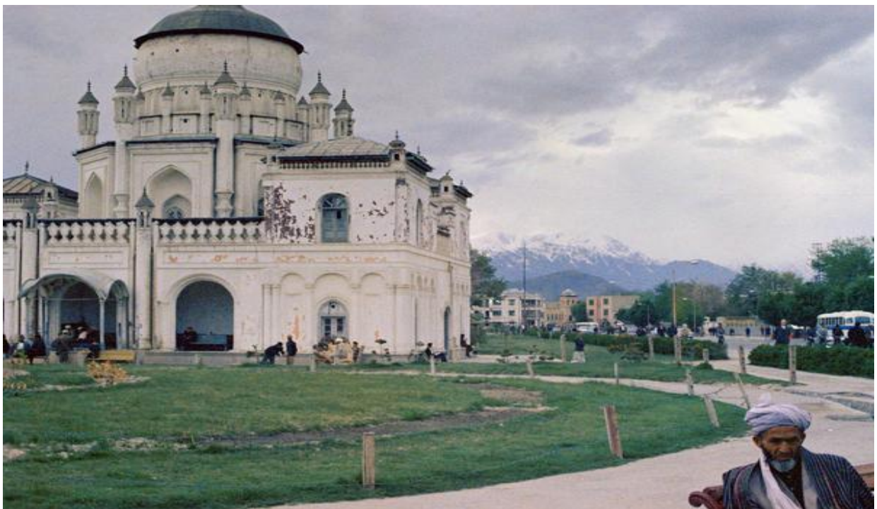
Fig. 3: Architecture in Kabul.