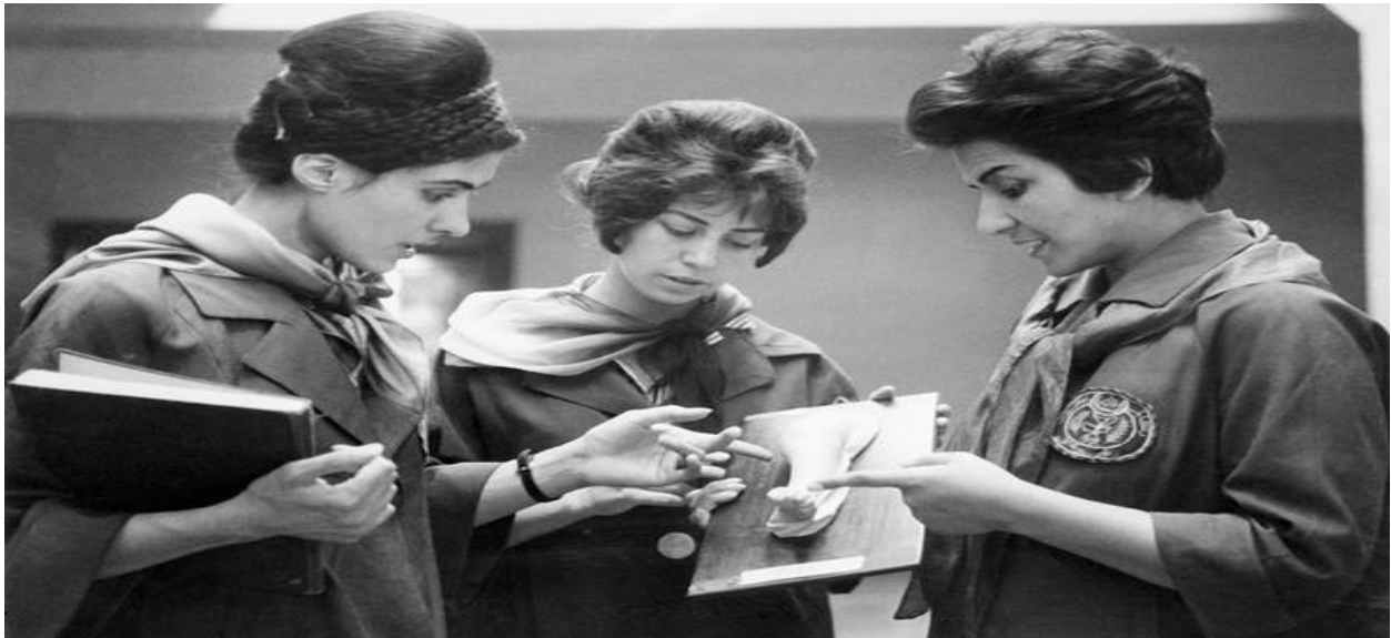
Figure 4: Two Afghan medicine students and their professor at the Faculty of Medicine in Kabul.