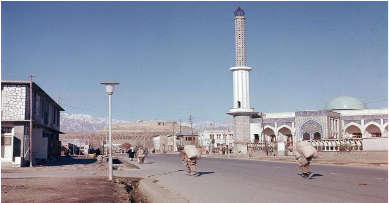
Figure 2: A view of one of the new mosques erected in the suburb of Kabul.