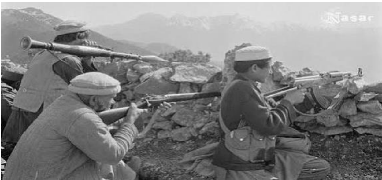
Fig. 5: Mujahideen targeting Soviet Soldiers in Kandahar, Afghanistan (1986)