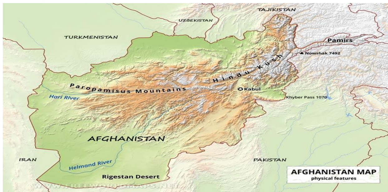
Map 2: The Paropamisus and Hindu Kush Mountain Chains Map of Afghanistan

The Paropamisus and Hindu Kush mountain chains characterize Northern Afghanistan. These chains broaden exactly 745 miles (1,200 Kilometers) from then, the Soviet border to Iran along the Paropamsus highlands. The width of this mountain massif extends from 186 to 311 miles (300 to 500 Kilometers). Mountain ranges peak from 6,562 to 24,428 feet (2,000 to 7,760 meters). Customary battle is not conceivable in this region (The Russian General Staff, 2002, p. 3).