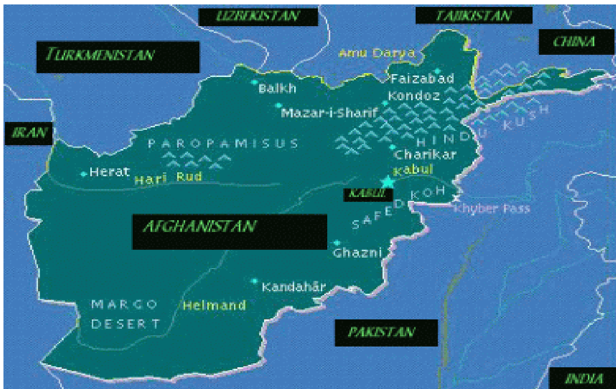
Map 1: Geographic Location Map of Afghanistan.

Being a landlocked country, which is located in Central Asia, Afghanistan is a center eastern state situated in south- central Asia. The country is 252,830 square miles (655,000 square Kilometers) (The Russian General Staff, 2002, p. 1). The geographic area of Afghanistan lies at roughly 33° North scope and 65° East longitude (Palka, 2001, p. 10). It is verged on the West by Iran and on the North by the previous Soviet republics of Turkmenistan, Uzbekistan and Tajikistan. The upper East tip of Afghanistan touches China, while Pakistan deceives the East and South (Otfinoski, 2004, p.1).