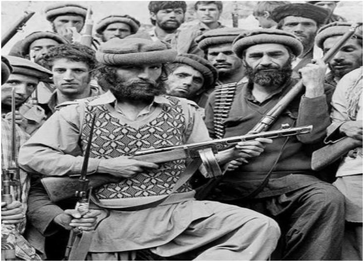
Fig. 6: Afghan Mujahideen During 1979- 1980 armed with a nice Soviet sub-machinegun.