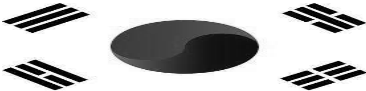
Fig. 3: The Flag of South Korea.

South Korea is a country in East Asia. It occupies the southern portion of the Korean peninsula. The country is bordered by the Democratic People's Republic of Korea (North Korea) to the north, the East Sea (Sea of Japan) to the east, the East China Sea to the south, and the Yellow Sea to the west; to the southeast it is separated from the Japanese island of Tsushima by the Korea Strait. South Korea makes up about 45 percent of the peninsula's land area. The capital is Seoul (Soul) (Bae, Lew, Ho Halm, & Chan Lee, n. d., p.).