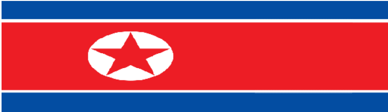
Fig. 2: The Flag of North Korea.

Wa(1950–53). The DMZ, which runs for about 150 miles (240 km), constitutes the 1953 military cease-fire line and roughly follows latitude 38° N (the 38th parallel) from the mouth of the Han River on the west coast of the Korean peninsula to a little south of the North Korean town of Kosŏng on the east coast (Bae, Ick, Ho Halm, and Chan Lee, n.d., p. 423).