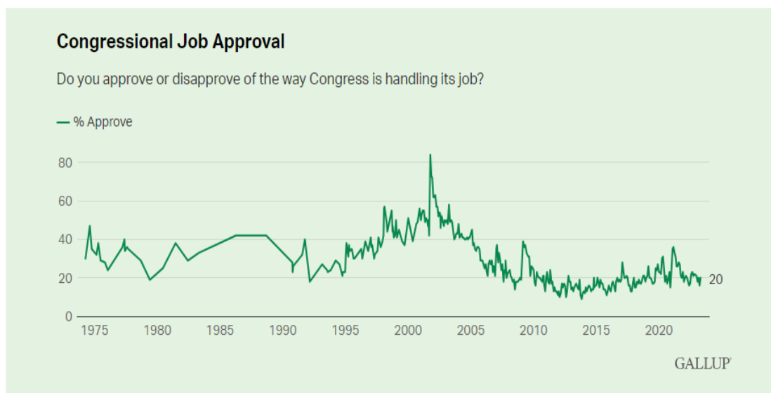
Figure (05): you approve or disapprove the way the congress is handling its job?

This poll showed that Public approval of Congress has fluctuated significantly since 1973, with approval ratings often falling below 50%. According to Gallup, the poll also found that the