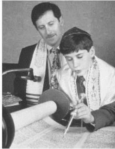
This boy reads from the Torah during his Bar Mitzvah.

http://www.everyculture.com/multi/images/gema_02_img0147.jpg